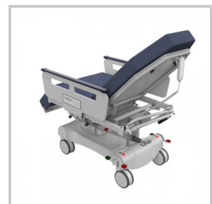
IV storage option