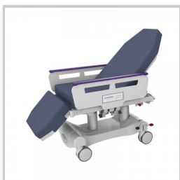
Deep Violet (Purple)