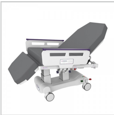
Contour Recline Barituff

To cater adequately for large and heavy patients, our design team has focused on larger, reinforced frameworks, electronics with increased weight capacity and specialised systems.