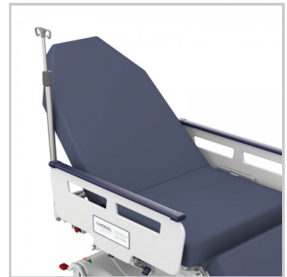
Chair IV Pole