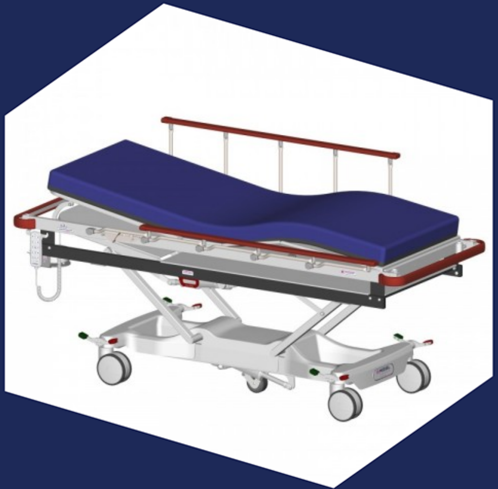
Contour Portare-X Servicing