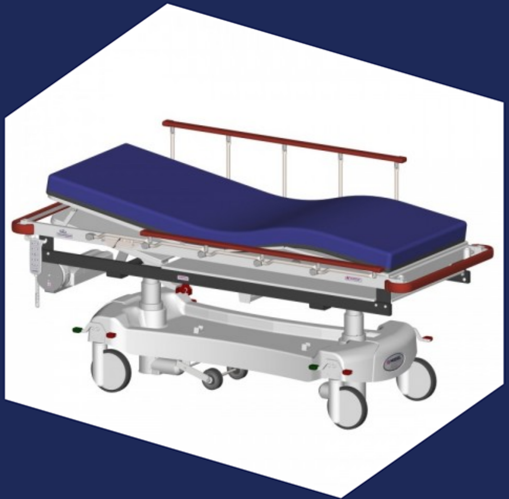
Contour Multi-X Electric Servicing