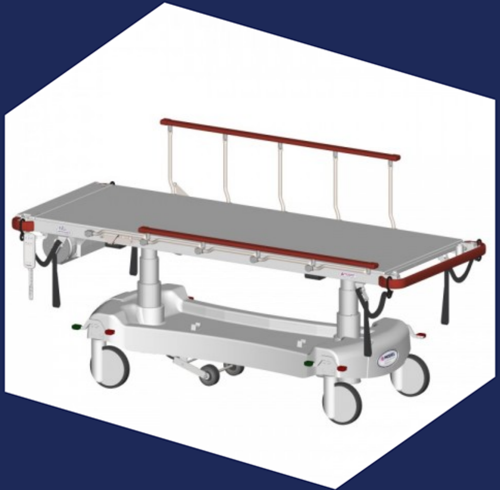
Contour Heli-Transfer Electric Servicing