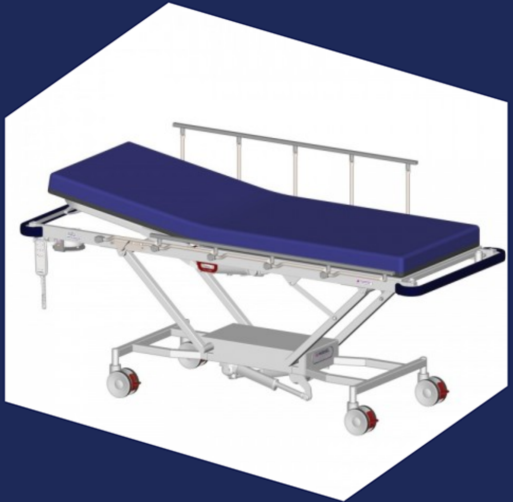
Contour Exami Servicing