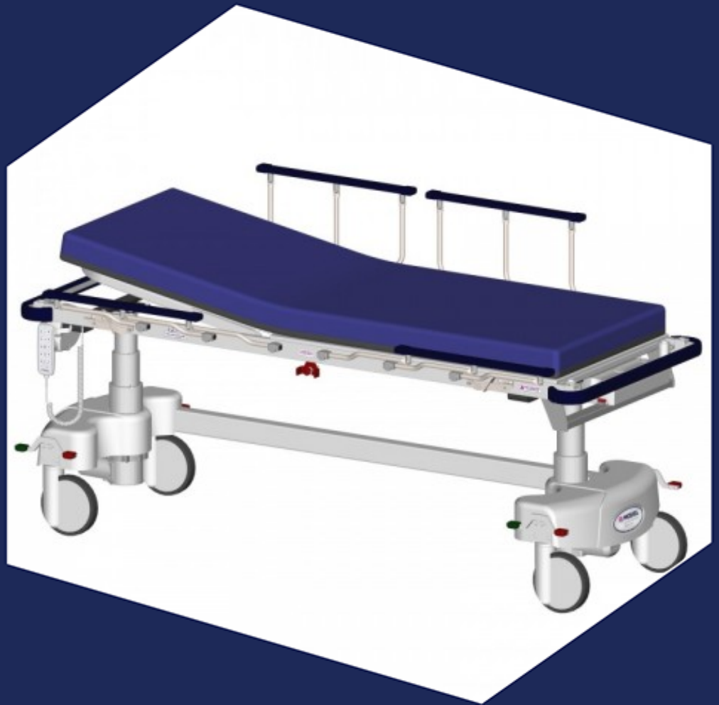
Contour Endo-X Servicing