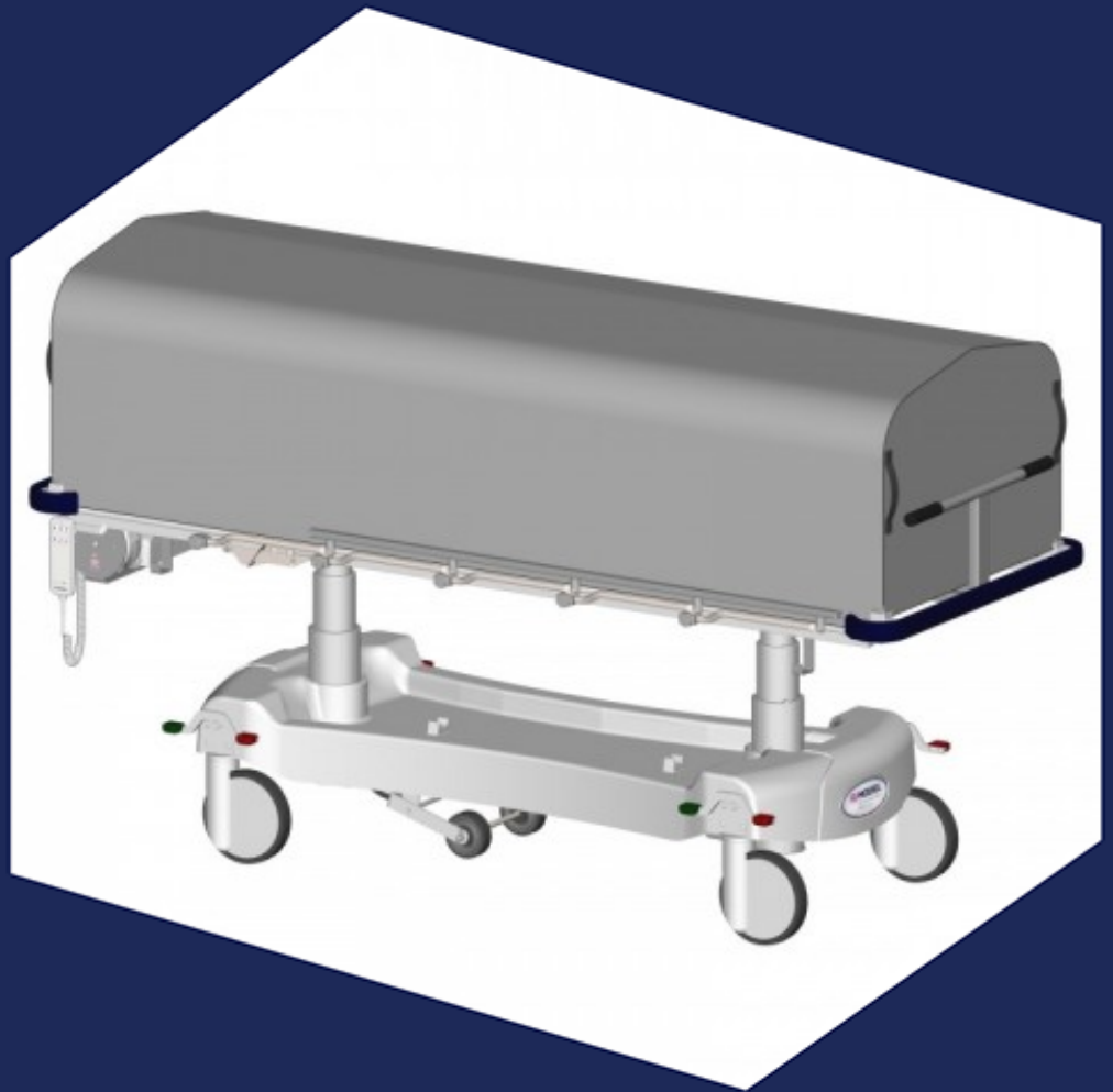
Contour Conceal Electric Servicing