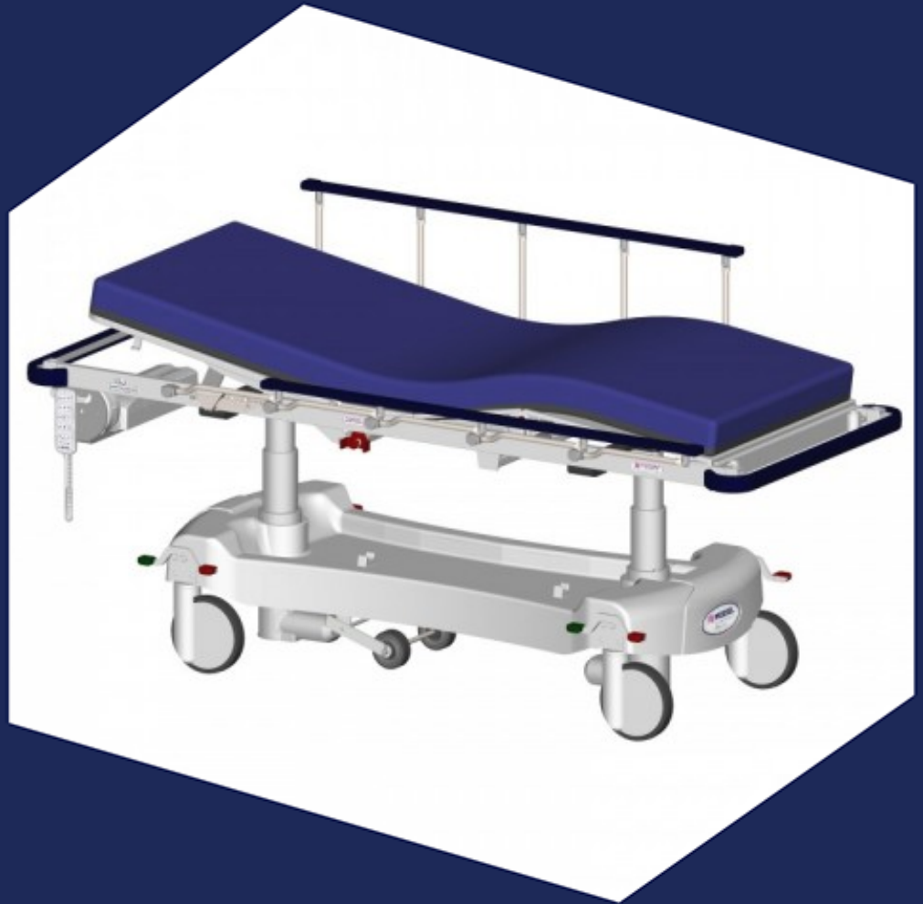
Contour Classic Electric Servicing